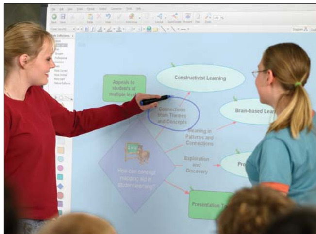
Easily attach links to files and multimedia content for even more impact.